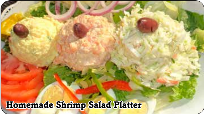
Homemade Shrimp Salad Platter