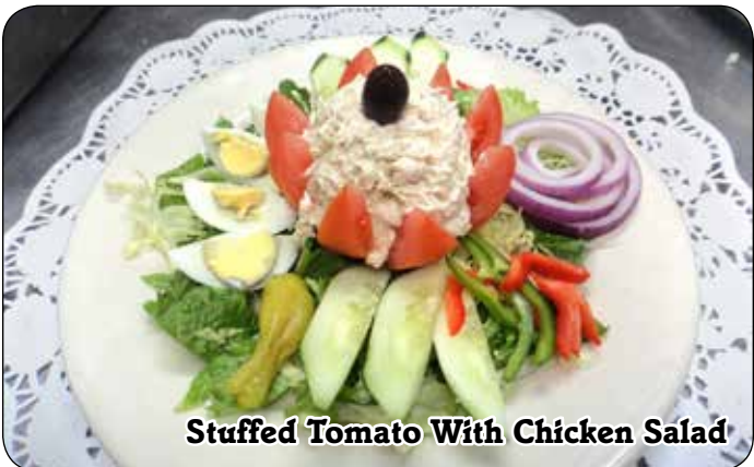
Stuffed Tomato With Chicken Salad